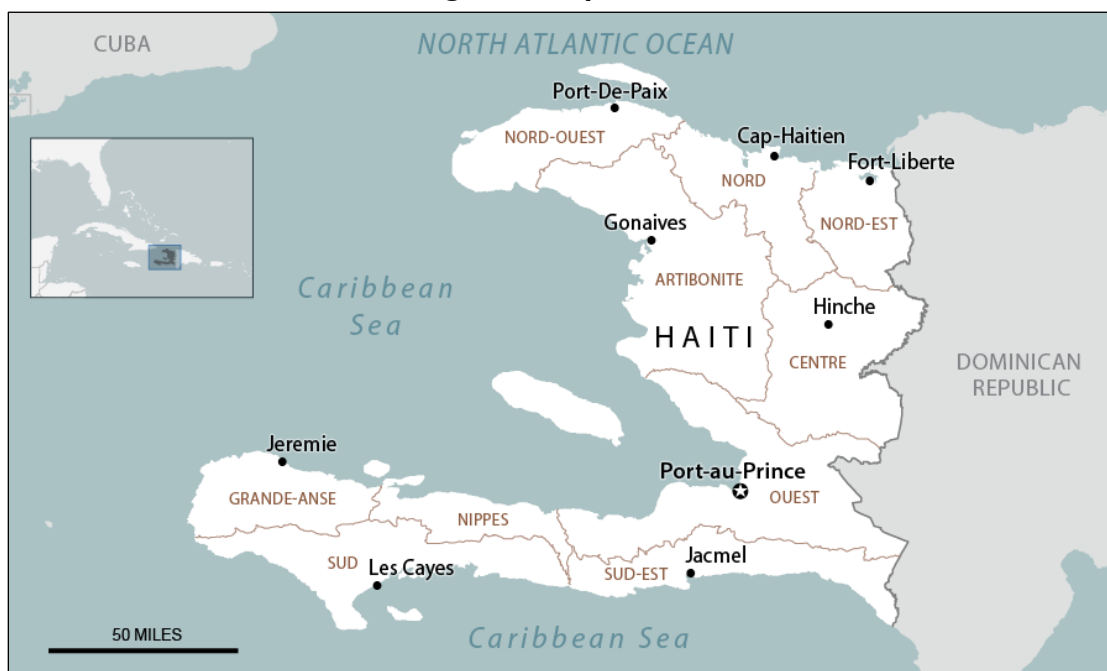
Figure I. Map of Haiti