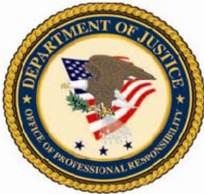
U.S. Department of Justice Office of Professional Responsibility