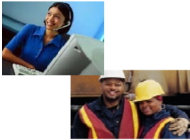
Top 30 U.S. States & Territories, by Total Workers Certified

“INNOVATION DISTINGUISHES BETWEEN A LEADER AND A FOLLOWER” - STEVE JOBS