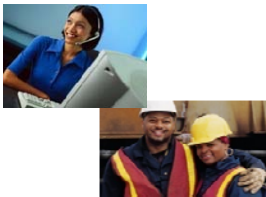
Top 30 U.S. States & Territories, by Total Workers Certified

“INNOVATION DISTINGUISHES BETWEEN A LEADER AND A FOLLOWER” - STEVE JOBS