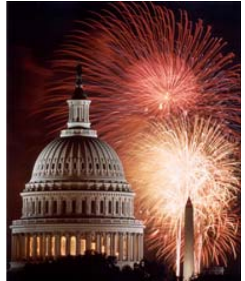
4 th of July Fireworks on the National Mall in Washington, D.C.

For more information on USCIS 4 th of July events, or to find the Naturalization Ceremony taking place nearest you, please see the Event List and Location Announcement at USCIS.gov .